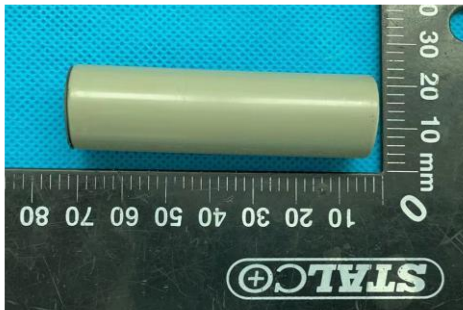
Photo 5 电池背面 Back view of Cell