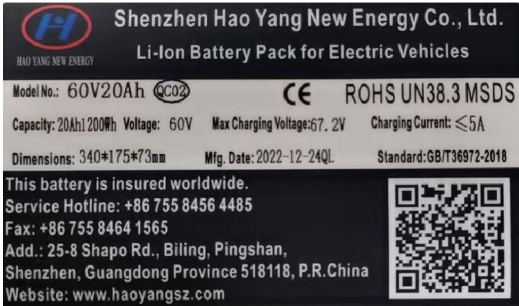
Photo 3 标签 Front view of label