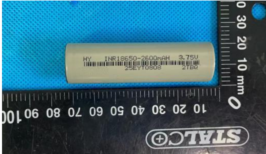
Photo 4 电池正面 Front view of Cell