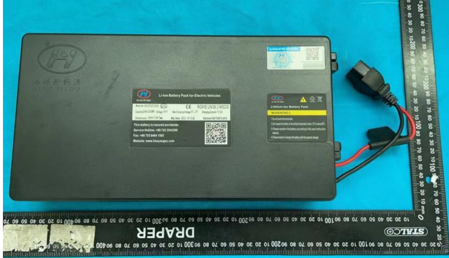
Photo 1 电池组正面 Front view of battery